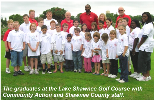
The graduates at the Lake Shawnee Golf Course with Community Action and Shawnee County staff.

The graduation culminated the 12-week summer program. Thirty-five