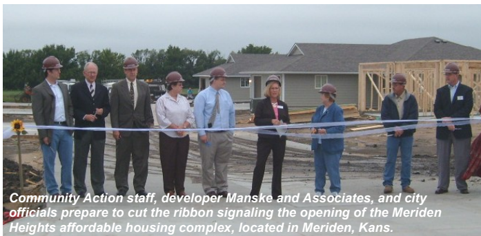
Community Action staff, developer Manske and Associates, and city officials prepare to cut the ribbon signaling the opening of the Meriden Heights affordable housing complex, located in Meriden, Kans.