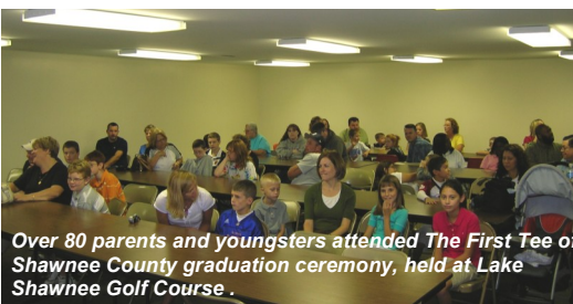
Over 80 parents and youngsters attended The First Tee of Shawnee County graduation ceremony, held at Lake Shawnee Golf Course.

The next step for these youngsters will be BIRDIE Level, which includes increased golf proficiency and advanced understanding and leadership around the