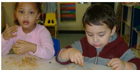
Improving classroom quality and promoting school readiness are the goals of The Creative Curriculum.

Pre-service activities included Creative Curriculum training provided by Teaching Strategies. Creative Curriculum is based on the latest research on how children learn best and has been shown