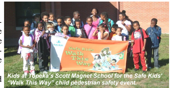
Kids at Topeka's Scott Magnet School for the Safe Kids' "Walk This Way" child pedestrian safety event.

In the United States, pedestrian injury is the second leading cause of injury-related death for children ages 5 to 14,