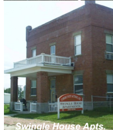
Swingle House Apts.

at Meriden Heights and Tanglewood and parking and building repair work at the Swingle House Apartments in Leonardville.