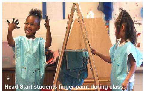
Head Start students finger paint during class.

In terms of enrollment, the monthly Head Start average for the period was 95 percent. However, seven of the 12 months were at 100 percent, with the figures only down during the summer months as kids move from Head Start to kindergarten and left Head Start services earlier than their eligibility would require.