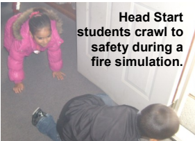
Head Start students crawl to safety during a fire simulation.

home on December 23, 2009. He was four at the time of his death. He had been a student with Community Action's Head Start program.