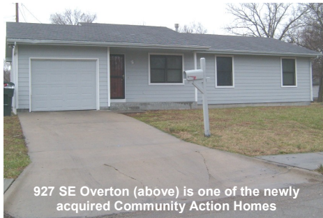
927 SE Overton (above) is one of the newly acquired Community Action Homes

screens applications for eligibility. We are pleased to have her as a part of our team.