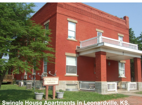
Swingle House Apartments in Leonardville, KS.

Looking ahead, weatherization and housing staff will attend the 2011 Kansas Housing Conference August 8 - 11 in Wichita and hope to bring back with them fresh ideas to enhance both programs as they move forward.