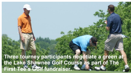
Three tourney participants negotiate a green at the Lake Shawnee Golf Course as part of The First Tee's Golf fundraiser.

More than 70 people participated, Eight companies were tournament sponsors and 25 companies and individuals sponsored holes at the tournament, and more than a dozen companies and individuals contributed prizes. Overall, about $8,500 has been raised this year to support First Tee programming. END