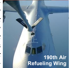
190th Air Refueling Wing