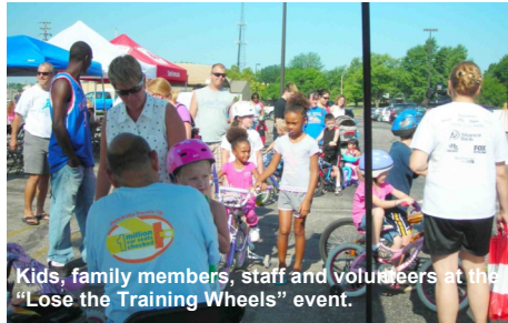
Kids, family members, staff and volunteers at the "Lose the Training Wheels" event.

COMMUNITY ACTION, INC. WILL mark its 20th year of distributing free school supplies at its annual Back-to-School Fair, to be held from 9 a.m. - noon on Saturday, August 6 at the Kansas Expocentre.