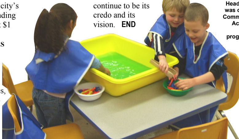
Head Start was one of Community Action's first programs.

As Community Action, Inc. continues into the new millennium, the call to "help people help themselves and each other" will continue to be its credo and its vision. END